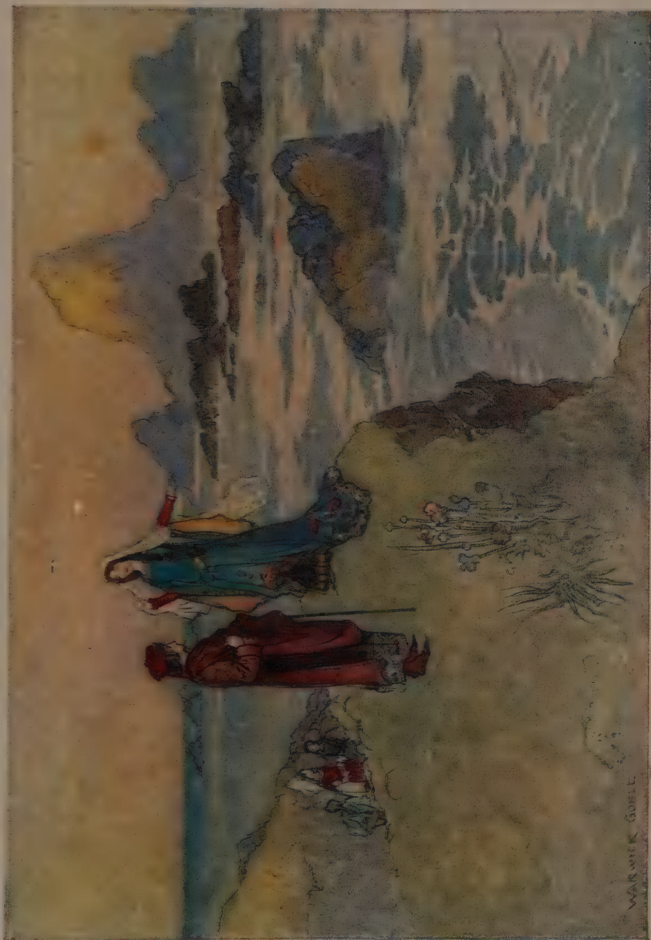
DORIGEN PLEDGING AURELIUS